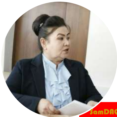
SamDARU Chairman of the Women's Council

Mirzo Ulug bek nomidagi SAMARQAND DAVLAT ARXITEKTURA QURILISH UNIVERSITETI